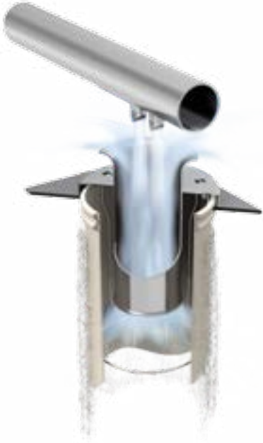
THE SCHEUCH IMPULS CLEANING SYSTEM WITH TWIN NOZZLES ENSURES CONSISTENT CLEANING THROUGHOUT THE FILTER BAGS.

The coordinated fine-tuning and interaction between individual components of the Scheuch impuls cleaning system provide a high-performance overall unit. This technology – which is subject to continuous development – has a clear advantage over conventional solutions on the market and enables consistent cleaning of each individual filter bag across the entire length of the system. This results in uniform ageing of the filter media with the lowest possible differential pressure. The extremely high percentage of secondary air enables the lowest possible compressed-air consumption and stops the dew point falling below the setpoint value, which would have negative consequences for the system.